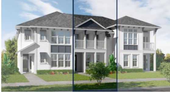
THE WEST INDIES

Living Area: 1,680 ft 2 Under Roof: 2,306 ft 2