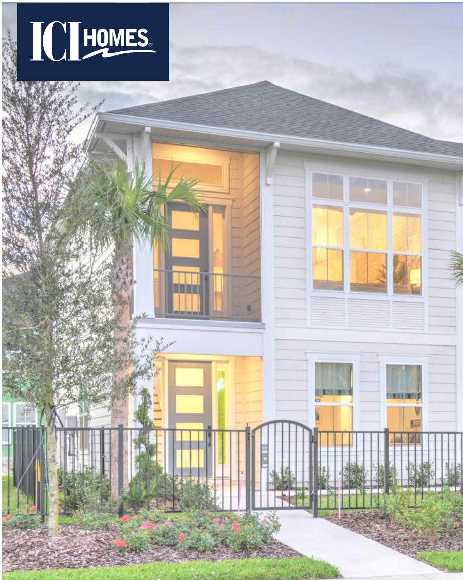
THE CASTILLO - C at NOCATEE