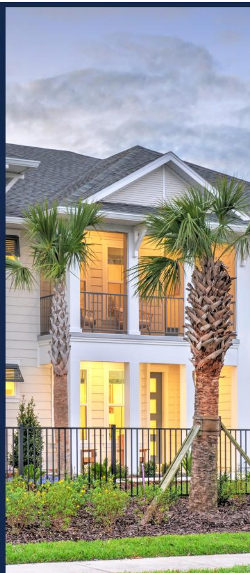
THE CASTILLO - WEST INDIES