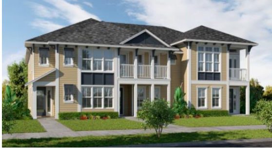
THE WEST INDIES

Living Area: 1,635 ft 2 Under Roof: 2,241 ft 2