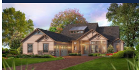
THE CRAFTSMAN II